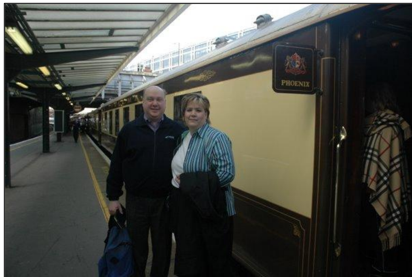
When we met we found we had so much in common, including a love for travel.

so I didn't understand a lot of what I was watching. I was awed by the scenes of astronauts floating in space. And I was thrilled to be with my dad, included in this seemingly grown up adventure. I loved spending time with my dad, watching him work on a project, listening as he