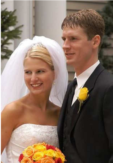
(Our wedding day, 8-14-04)