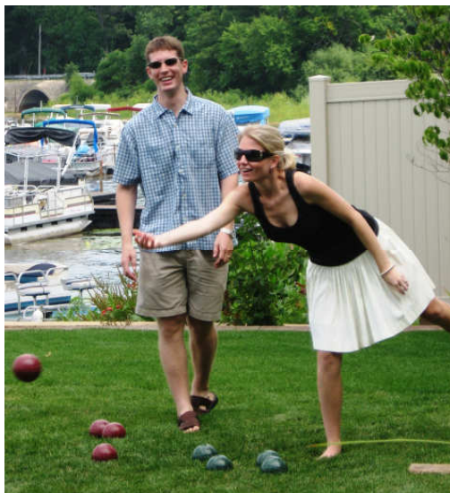
(Playing Bocce Ball on 4 th of July)

As it turns out, we are unable to get pregnant, without significant medical intervention. While we are very eager to have a child in our home, we do not grieve over this infertility. Instead, the diagnosis just confirms what we have long believed – that our beautiful baby will come to us through the gift of adoption.